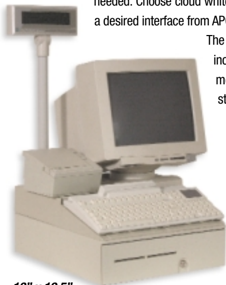
16" x 19.5"

The Flush Cap on the Series 100 version of the Caddy System allows space to be maximized to fit various peripherals.