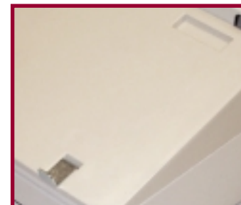
Keyboard Clips & Footrests