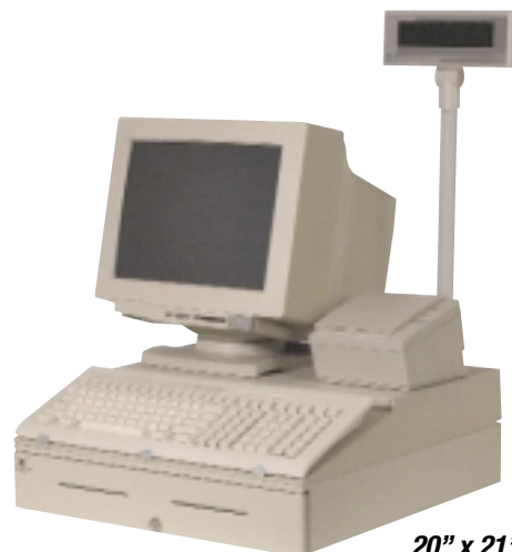
20" x 21"