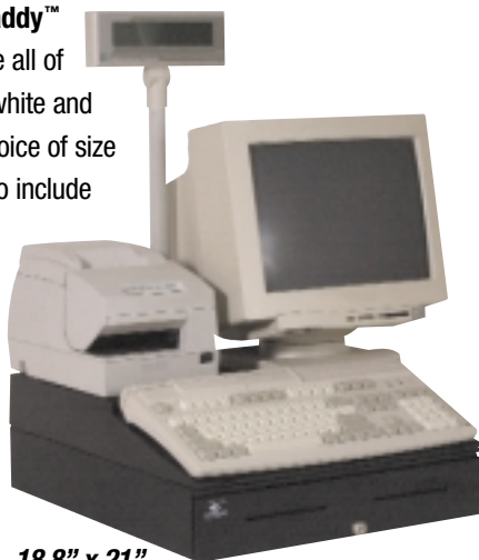
18.8" x 21"

The versatile Series 4000 Cash Drawer Caddy™ System provides plenty of space to arrange all of your peripherals. Standard colors of cloud white and black are both available, as well as your choice of size and interface. The Series 4000 drawers also include dual media slots and storage locations for coin rolls, packaged bills, and media.